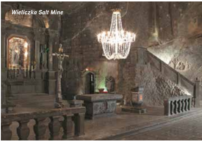
Wieliczka Salt Mine