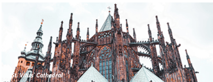
St. Vitus' Cathedral

Today we will enjoy a full day tour of Prague, starting with a visit to Loreto Shrine, one of the most important pilgrimage shrines in the Czech Republic. Then proceed to Prague Castle where we will visit St. Vitus Cathedral, St. George's Basilica, the picturesque Golden Lane, the Royal Palace and St. George's Convent. Then proceed